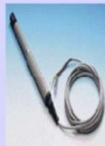
Temperature / Humidity